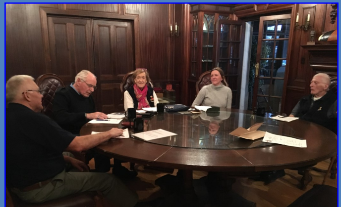
Your Wing Executive at work, November 2018

Parking is available at the back of the building.